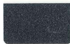
C80-1408 Sparkle White 10-100 micron