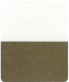
C81-1218 Iridescent Gold 10-60 micron