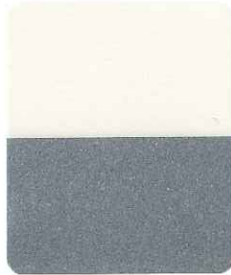
C80-1208 Silver White 10-60 micron