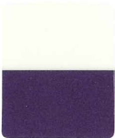
C81-1248 Iridescent Violet 10-60 micron