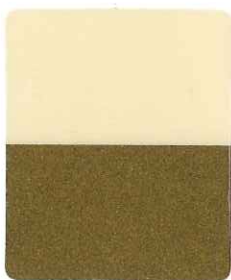
C84-6118 Gold 10-60 micron