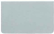
C80-1008 Ultra Fine White 2-12 micron