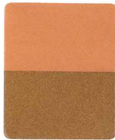
C84-6288 Bronze 10-60 micron