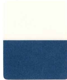
C81-1258 Iridescent Blue 10-60 micron