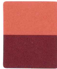
C84-6278 Maroon 10-60 micron