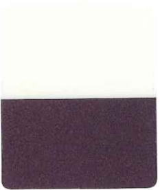
C81-1238 Iridescent Red 10-60 micron