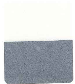
C80-1608 Pearl Silver 10-60 micron