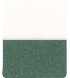
C81-1268 Iridescent Green 10-60 micron