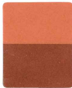
C84-6298 Copper 10-60 micron